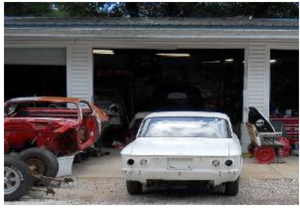
June Bug is at the Paint Shop