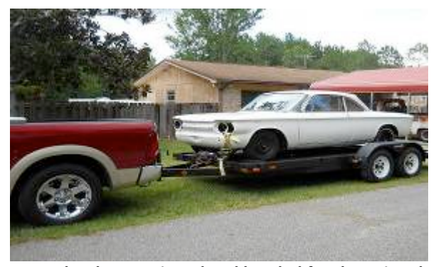
June Bug has been stripped and headed for the Paint Shop