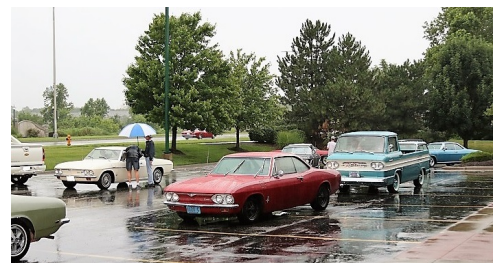
The rain fell mainly on the econo-run - start