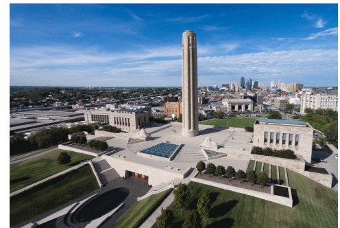
Arial view of the WWI museum