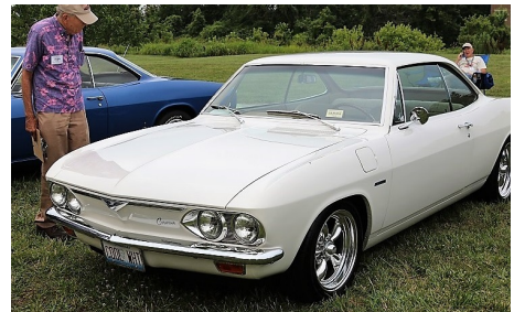
Jim Allen’s Cool White