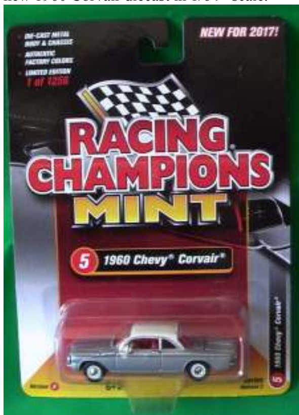
Comes in 2 colors so far.