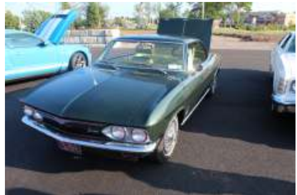
Adrian's Super Cruise, Grand Island