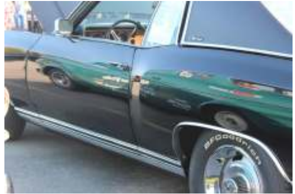
Note reflection of Pat Pilon's Studebaker on the side of the Monte Carlo