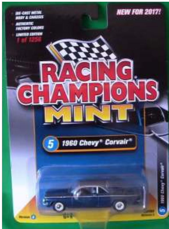
Looks like Racing Champions has issued a new 1960 Corvair diecast in 1/64 th scale.