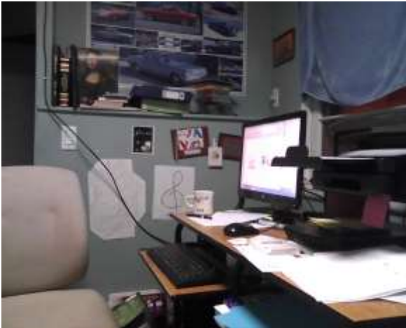
Yes, this is the real thing... your editor's desk!

I held off on publishing a July issue, hoping for some input from fellow Inland Northwest Club members. Deciding to combine issues for July and August, I was set to finish it up when I was asked to hold off for a day or two while information about a couple of events was finalized. At long last, here is the latest edition of the Rear Engine Review.