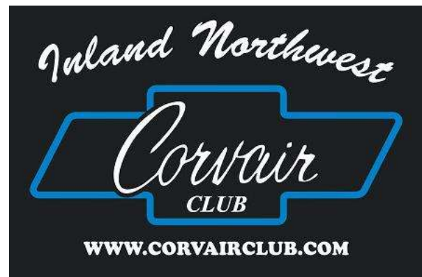
The front of the card looks like this.