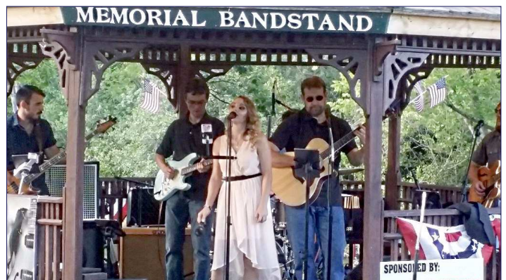
Copied From The Winnisquam Echo August 3, 2017