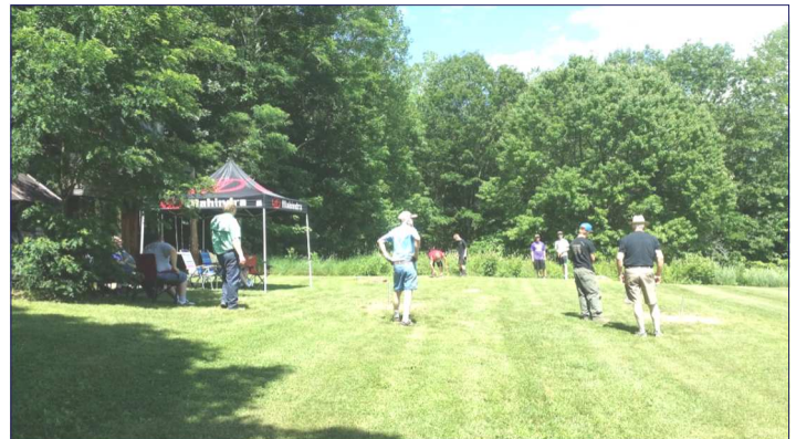
Horseshoes on the 4th are a club tradition.