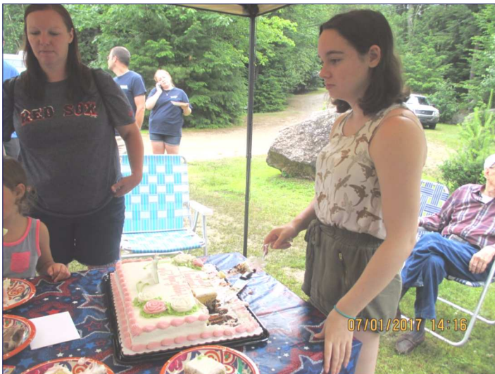
celebrated her 21st birthday early since it actually takes