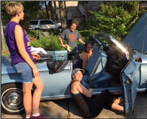
Post Harvey clean up crew for Old Blue

CLUB MEETING TO BE HELD ON FRIDAY SEPT. 15TH AT THE FEEHERRY PARTY BARN