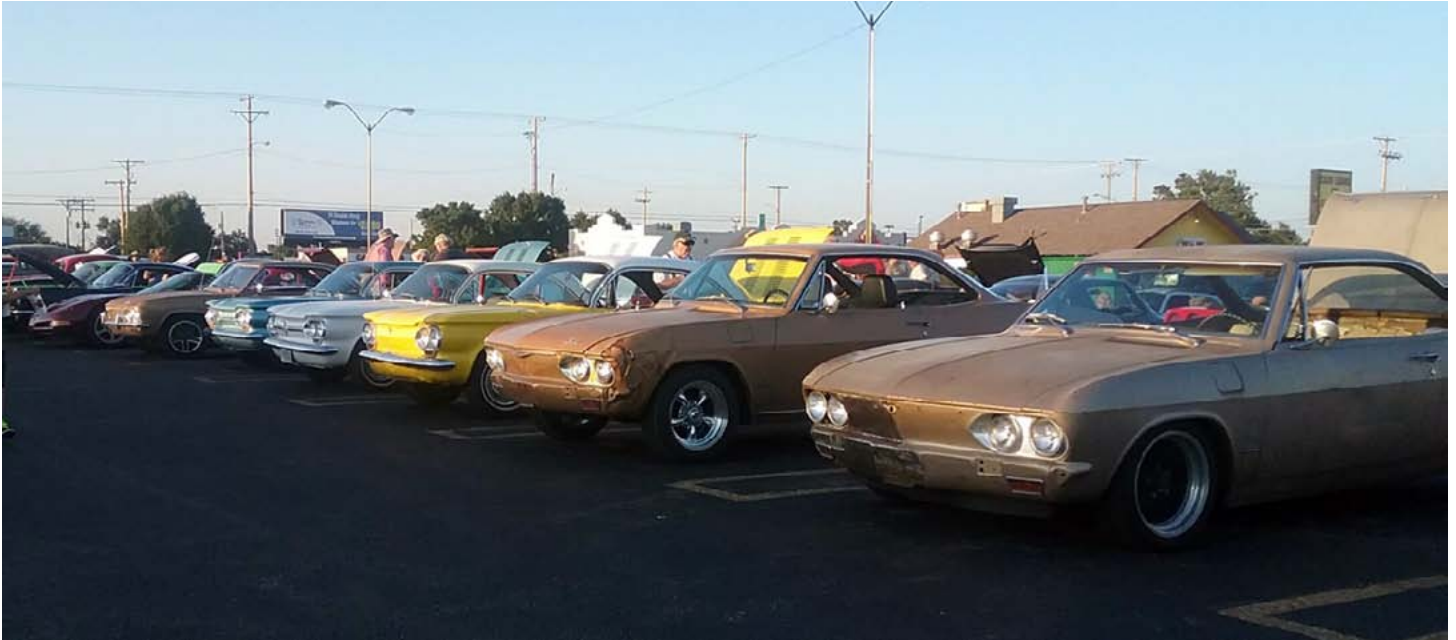
ABOVE: An excellent line up of Corvairs were on display at the third Friday in August Central and West Show and Shine.