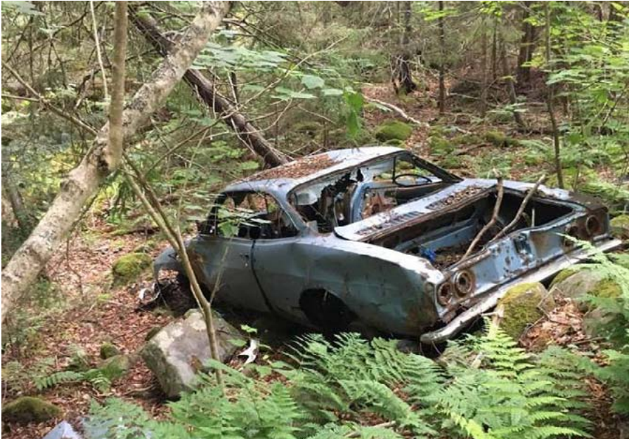
Ran when parked. Lake Nova Scotia, Canada. If you have Ran When Parked photos, send to tkalp@cox.net.