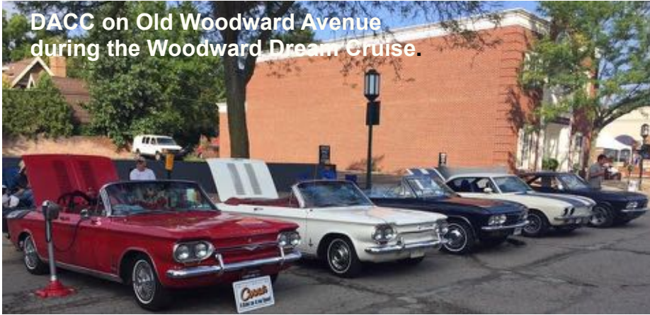
DACC on Old Woodward Avenue during the Woodward Dream Cruise.