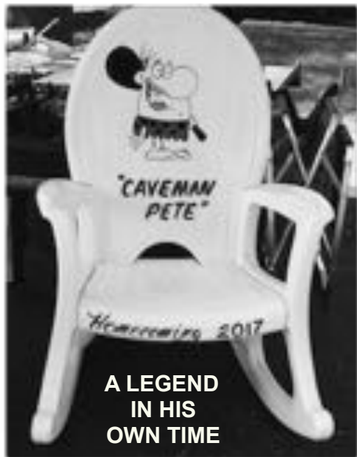
A LEGEND IN HIS OWN TIME