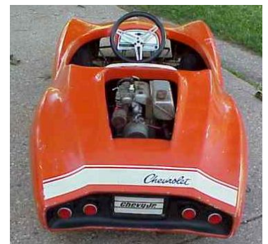
Chevy Junior (later)