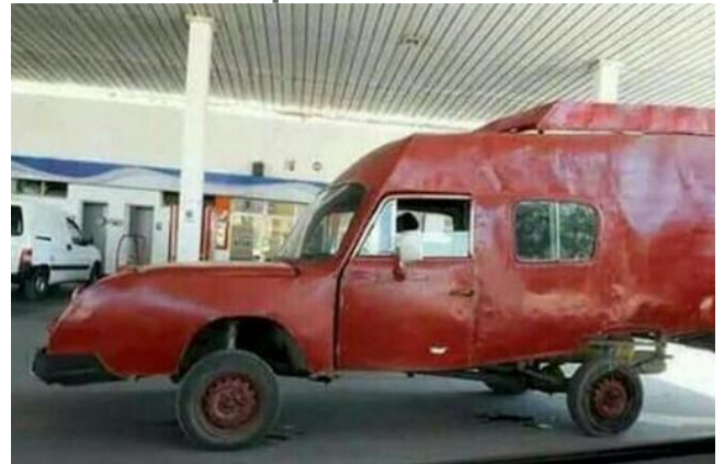
The car we drew in Kindergarten actually exists! [Is it a Corvair – who knows?! – ed]

..... CMI is a non-profit corporation, chartered with The CORVAIR Society of America. Send CORVAIR Minnesota's $20.00 annual dues, payable by Jan 01, to the CMI Treasurer. Membership in CORVAIR Minnesota entitles you to the monthly newsletter, "The Leeky Seel", with free ads for members, a club window sticker, discounts on club activities, information on parts availability, and good advice on the preservation and enjoyment of the CORVAIR automobile.... Yeah!