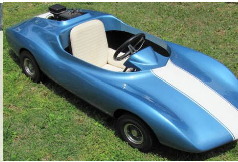
Chevy Junior (68-71)