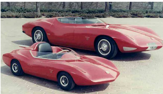
Monza SS with Monza Junior (65-67)