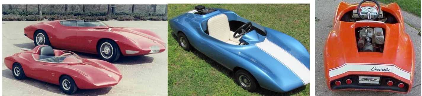
Monza SS with Monza Junior (65-67)