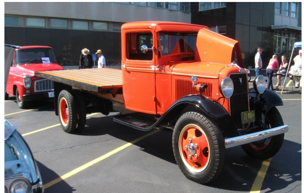
SOS show flat bed truck