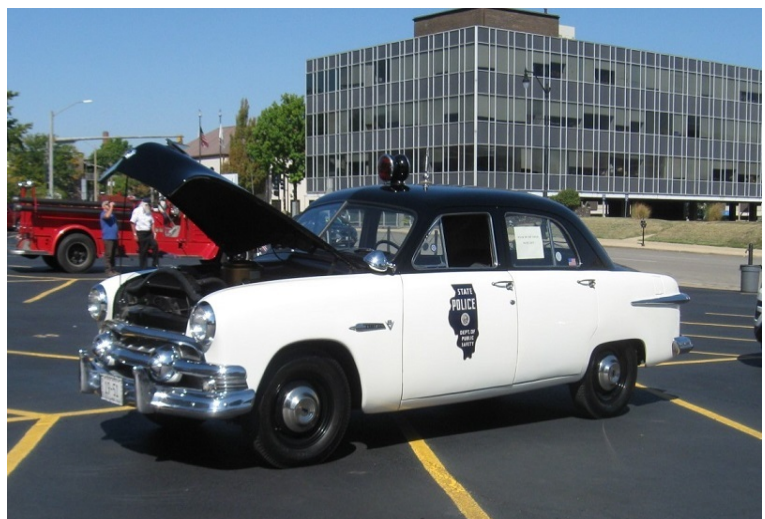
Illinois State Police Foundation vintage Patrol Car, SOS show.