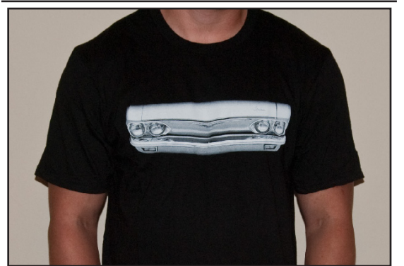
High quality 100% cotton T-shirts available at http://www.corvairhouston.etsy.com. Order yours TODAY while supplies last!