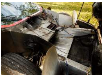
The “semi-monocoque” front of the car adds to chassis stiffness.

country roads, though he did autocross the car once during his time in Southern California. “I didn’t have any autocross experience then,” he said, “but the car still finished in the middle of the Corvettes running that day.”