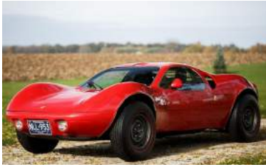
1968 Molzon Corvair.