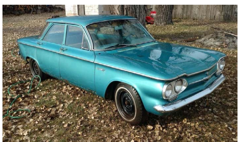
Still wet after a soap and water bath, Williams sedan shows a much improved appearance. Surprisingly the paint was still in pretty good shape except for a couple of spots.

After cleaning decades of leaves and other debris from under the top engine shroud.