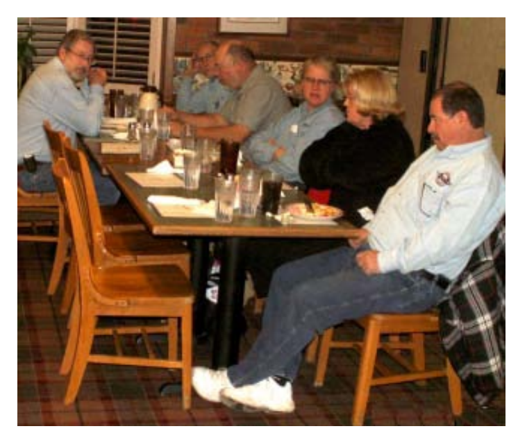
Ten years younger. This photo is from the 2008 MCCA Pre-Spring Fling at Spears West.