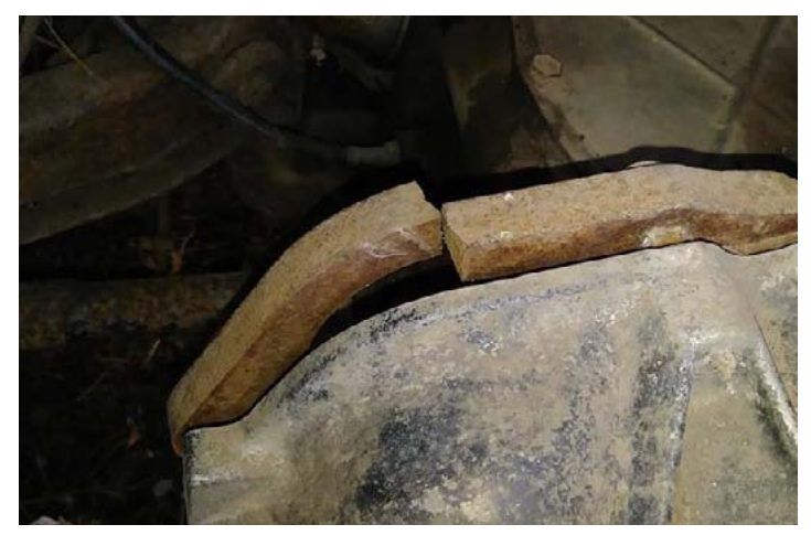
Sam's differential case was cracked near the starter.