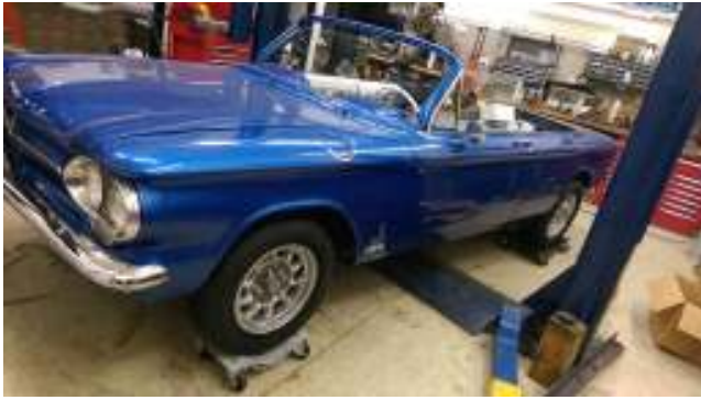
More pictures of Tom Koprevich's build.