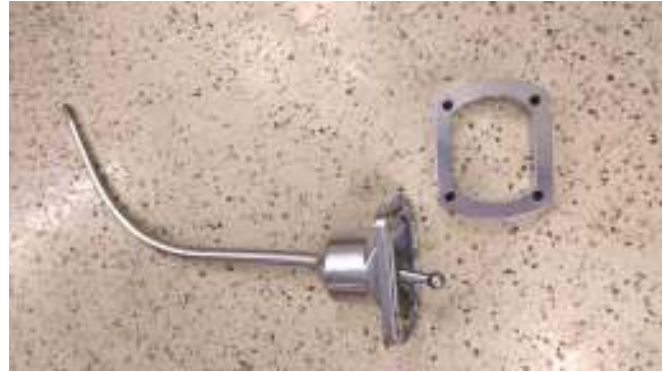
A modified 3-speed short shifter.

I pressed the ball pivot further up on the shaft 29/32" and for good measure put a few tig tacks on it to make sure it would not move in the future. Since I did not have a 3 speed housing, I made a 29/32" spacer to lift up the 4 speed housing.