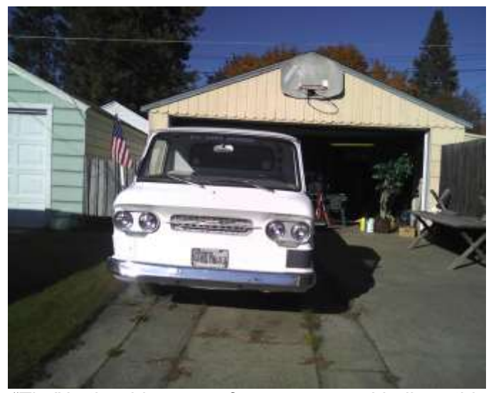
"Tim" in the driveway a few years ago. I believe this is where "he" sat until sold and hauled off to his new home.

First of all, I hope everyone had a great Holiday Season. I can't say it was the best, but it certainly was eventful. Right after I sent out the November issue of the REAR ENGINED REVIEW, and the Monday prior to Thanksgiving, I underwent bowel resection surgery. I was home in time to partake somewhat sparingly of turkey and all the fixings of the traditional meal. It looked as if I was on the road to a rapid and full recovery. However, about a week after the procedure, I developed a bacterial infection in my digestive tract, and that complicated and delayed the healing and recovery process.