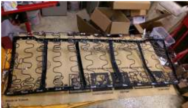
I took all the springs out and harvested some from the other frame and blasted everything, painted and reassembled with new Baker clips.