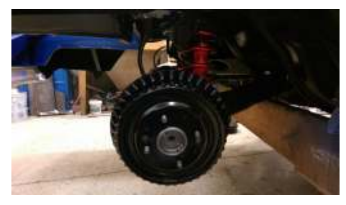
For more on this project go to Corvair Center: <a href="http://corvaircenter.com/phorum/read.php?1,921042,page=1">http://corvaircenter.com/phorum/read.php?1,921042,page=1</a>