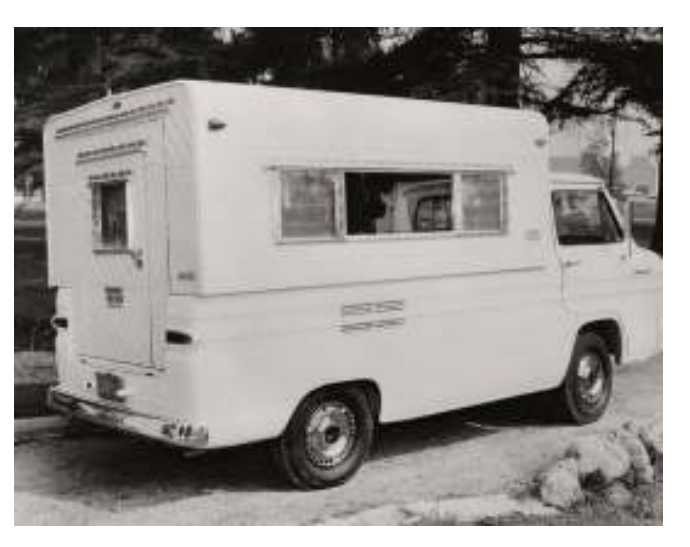
Loadside Camper? You have to be short to get into this one without banging your head! GM Prototype?