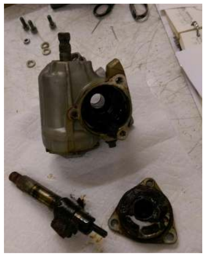
Tore apart the steering box, all the grease was like jello.