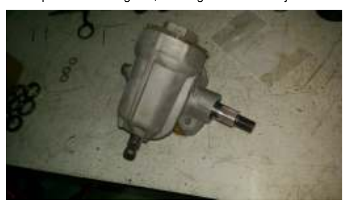
All adjusted and ready to install.