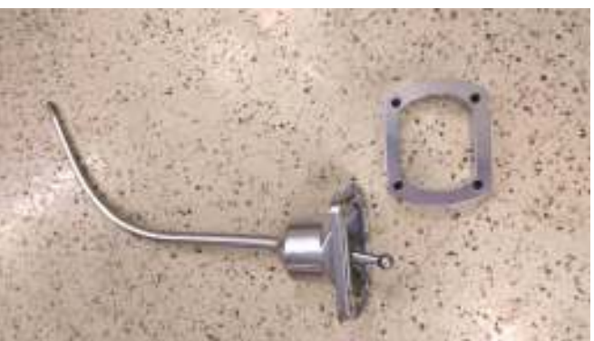
A modified 3-speed short shifter.

I pressed the ball pivot further up on the shaft 29/32" and for good measure put a few tig tacks on it to make sure it would not move in the future.