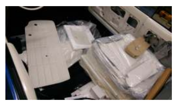
Also, got my full interior delivered today. This should keep be plenty busy!