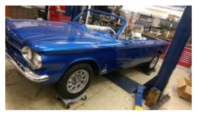
More pictures of Tom Koprevich's build.