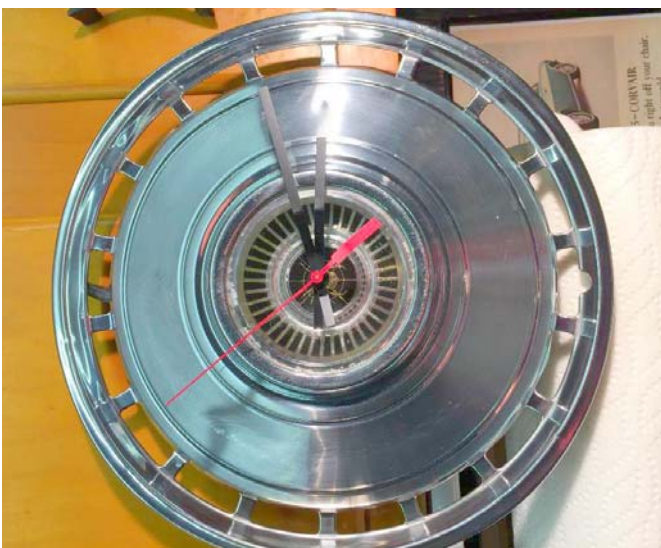
I AM SURE YOU WILL FIND THESE FOR SALE AT THE UPCOMING CONVENTION