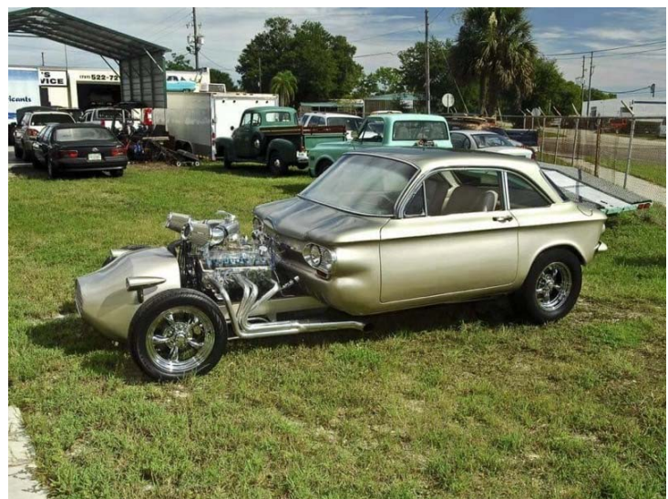
This what happens if you are really "creative?"