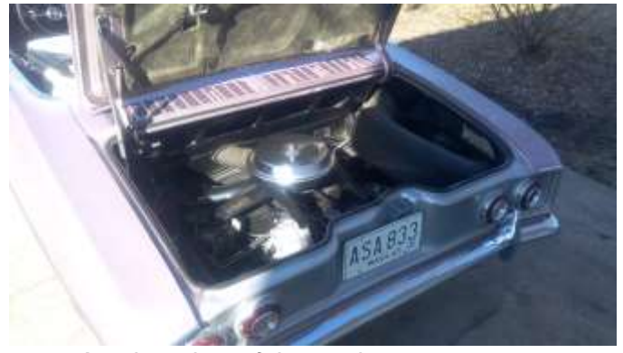
Another view of the engine compartment