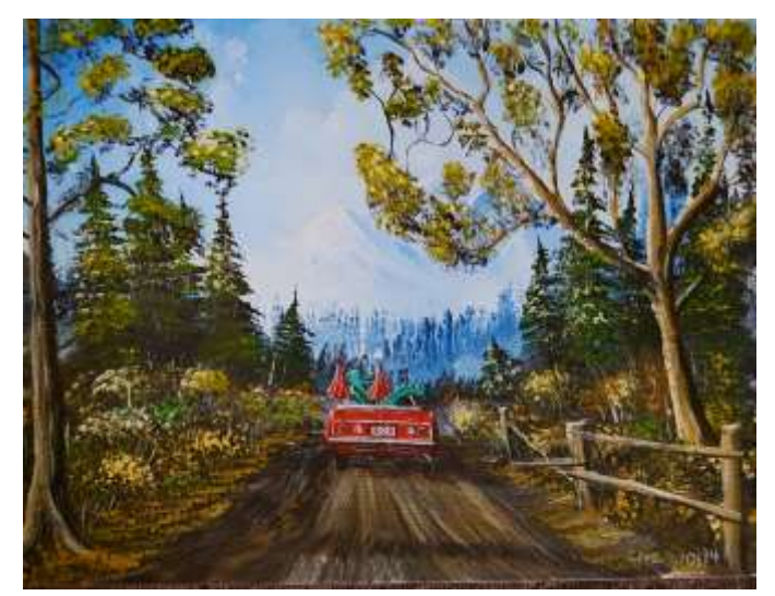
"The Dragon Goes for a Drive... in a Corvair!" Painted as an auction item for Saint George's School, back in the 90s. If memory serves, a later version was actually donated and auctioned off.

I recently attended the Inland Car Club Council's Show No Shine Event, known this year as the Monster Mash. It was a grand affair with nearly 200 people. As near as I could tell, I and one other individual were the only active members of the Inland Northwest Corvair Club in attendance. I had been hoping that we would have had more of our folks there. And in hindsight I realized that we could have put together and donated a gift basket for the prize raffle. I keep wondering why it seems we do not want to get involved with the other car clubs in the area.