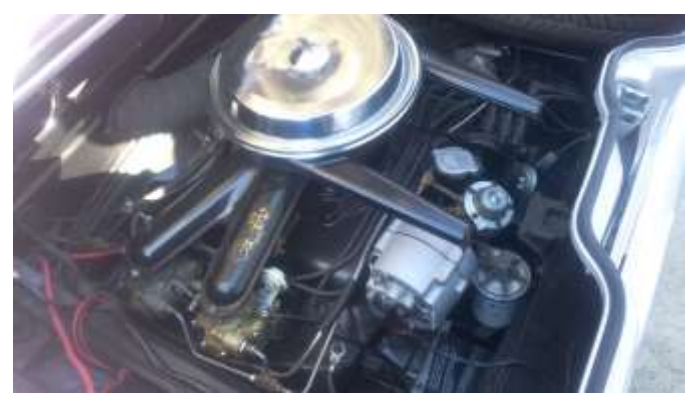
The 164 cubic inch, 140 horsepower, 4 carburetor engine.