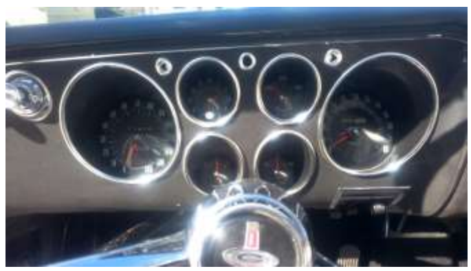
Close up of the classic Corsa instrument panel