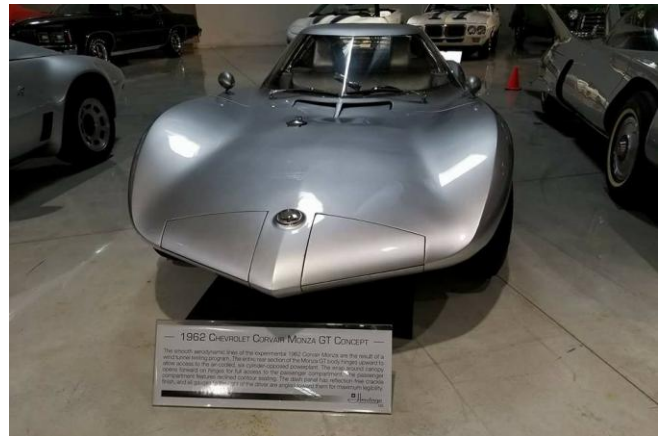
Pat Murphy sent along some pics of the GM Heritage Museum