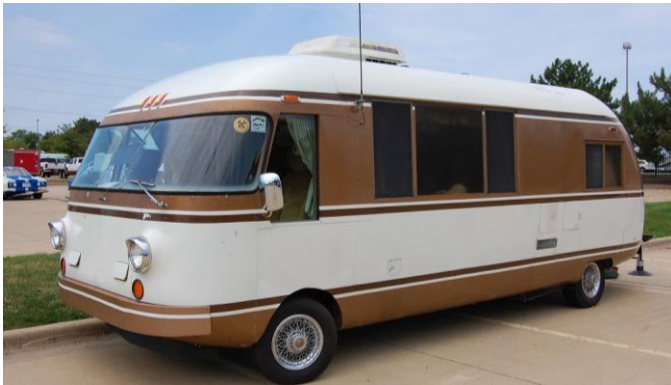
Pics from 2016

https://www.flickr.com/photos/89344545@N08/albums