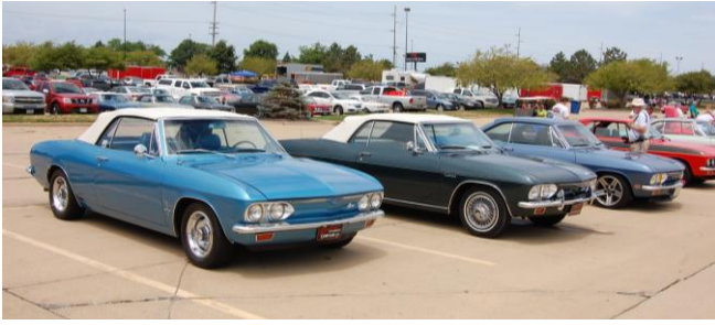
Thanks again to Ron Fedorczak for sharing these pictures of the 2016 CORSA Convention, some shots from 2017 maybe next month.