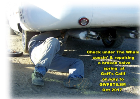
Chuck under The Whale cussin' & repairing a broken valve spring at Goff's Calif on way to GWFBT&SM Oct 2017

When I pulled the valve cover off I was greeted with a broken valve spring on #6. My heads had been given a clean bill of health by my engine rebuilder a year ago, so this was a surprise indeed! I didn't carry spare valve springs or valve spring tools with me. This has now changed. Being 50 miles from the nearest parts