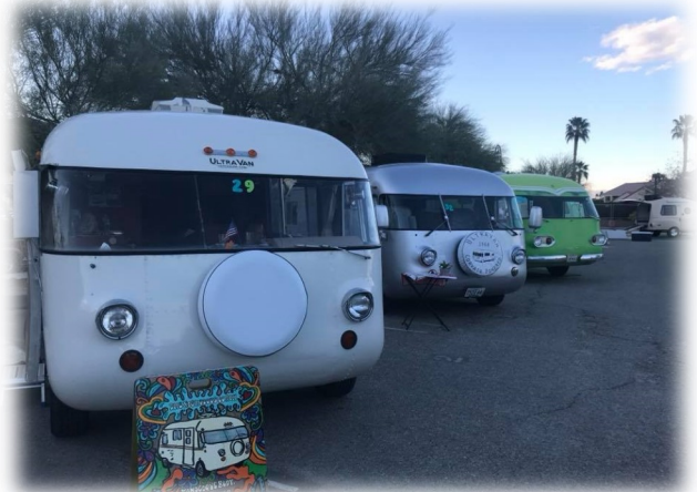
The Tres Amigos; The Righteous Coach, Mini Mo, and The Green Machine

The show was amazing! Literally thousands of people touring our coaches both Saturday and Sunday (Friday was for set up and a cocktail party).