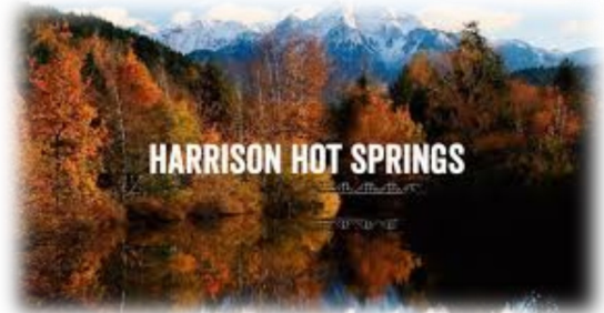
HARRISON HOT SPRINGS

It seemed natural then to tie in the Western States Rally at the end of this event. So, the Rally is scheduled for May 28-31, immediately after the Econo Run. It only begins at Harrison Hot Springs and then will move to Vancouver Island to explore its small towns and beautiful sights.