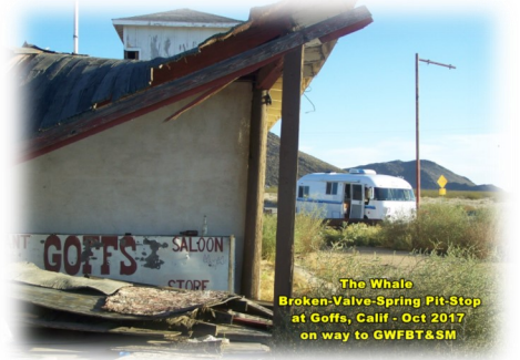
The Whale Broken-Valve-Spring Pit-Stop at Goffs, Calif - Oct 2017 on way to GWFBT&SM

A couple miles before Goffs, population 23, The Whale lost power on one cylinder. I was hoping for a simple problem like a loose spark plug wire, but a couple odd backfires told me it was going to be more complicated. We pulled over at the abandoned town center at Goffs and set to researching the problem. No visible issues in the engine bay. I pulled out my heat sensor gun and aimed it at the individual header pipes and found #6 to be cold. At this point I knew exactly what to do; advise Cyndie to pull out a lawn chair and pour herself a glass of wine.