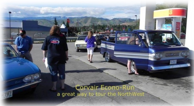
Corvair Econo-Run a great way to tour the NorthWest

The Rally will be held immediately after the Northwest Corvair Econo Run. For those of you who don't know what an Econo Run is, it is an event sponsored by single or multiple Corvair Clubs, in this case, in WA, OR, ID and British Columbia. It covers a course of 100 miles (160.934 kilometers) and is to determine who can achieve the best gas mileage over the course. The event rotates each year between the clubs in these states and the BC province. This year it is sponsored by Western Canada CORSA and will be held in Harrison Hot Springs, BC, Canada. The Econo Run takes place May 25-27 (Memorial Day Weekend in the USA, but not in Canada) and six UVMCC Ultra Vans will be participating.