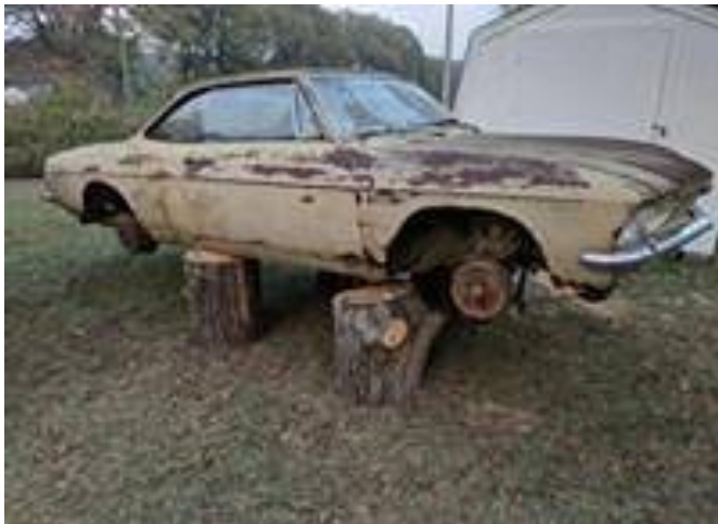
'66 Parts Car