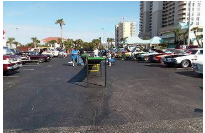
Valve Cover Races and Corn Hole Tournament held in the Parking Lot at our Corvair Lovers Holiday in February