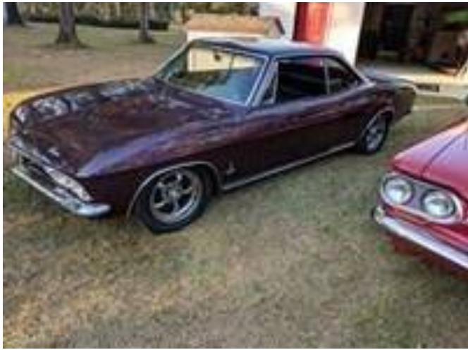
'65 Monza Custom