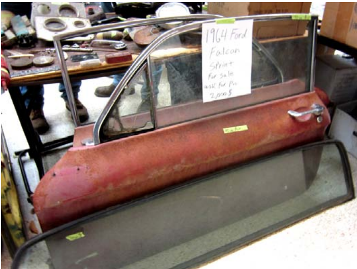
It is just wrong to advertise Falcon parts on an EM coupe door, but this vendor did it anyway.