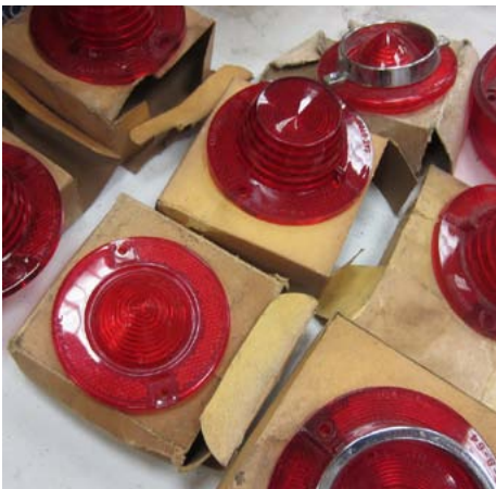
Mixed in with these GlowBrite replacement taillight lenses were two '64 Corvair lenses and a '65.