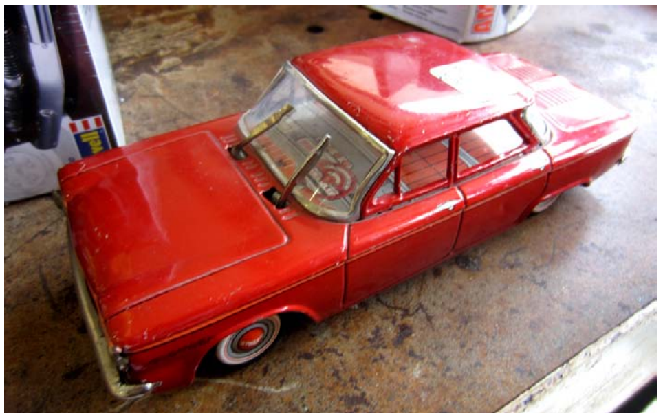
There were a couple of Corvair Toys at the swap meet. This pressed tin EM four-door sedan sported friction drive and working wipers.