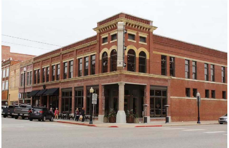
The Mercantile in Pawhuska, OK. MCCA is headed there for the first road trip of 2018. The store is owned by Ree Drummond star of the Food Network's hit show, "The Pioneer Woman".

MCCA events for April begin with the monthly meeting Saturday, the 14th. The following Friday is MCCA night at the Central and West car show. The next day, Saturday 21st is Cars & Coffee in the morning. The final Saturday in April, the 28th is our Road Trip to Pawhuska, OK. Details on page three. It should be a fun trip.