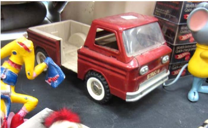
Another toy. This Structo Rampside was in rougher shape and missing the important ramp parts.