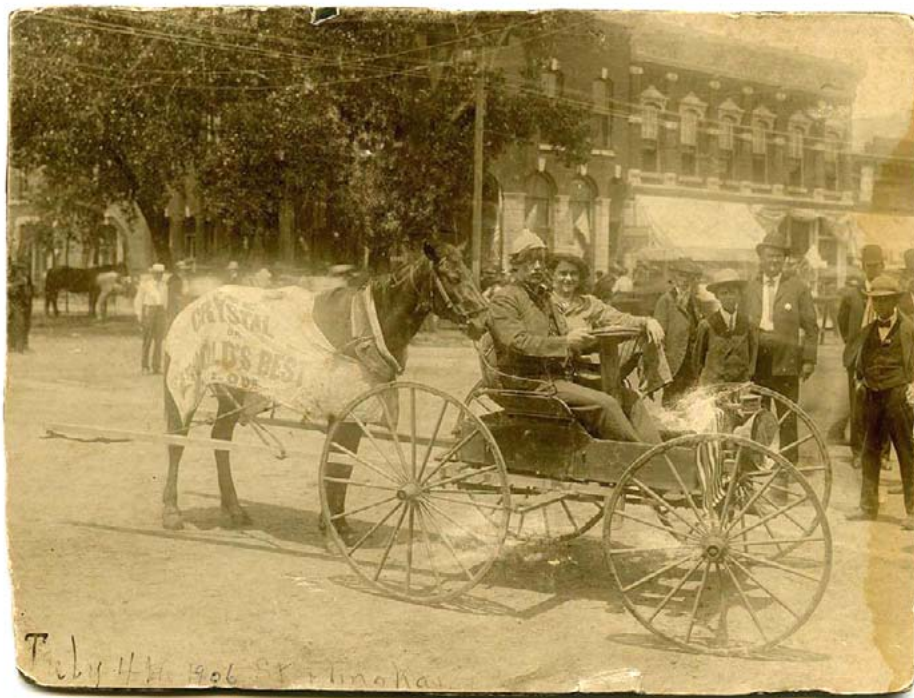
Very early prototype Corvair rear engine concept. It was posted on the Old and interesting places in Kansas Facebook page by Jim Booker.