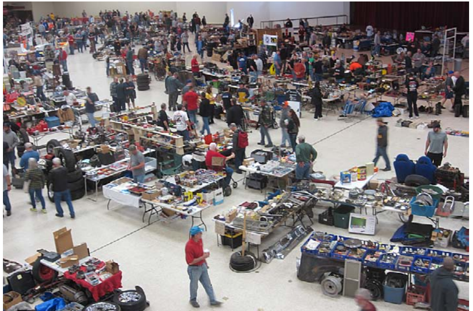
Moving the Winter swap meet from the Pavilions to Century II resulted in much less dust but also less exhibition area.