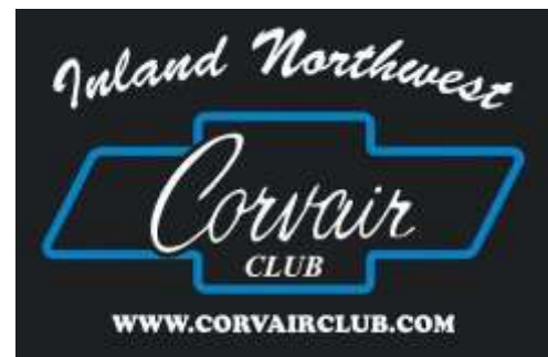
The front of the card looks like this.