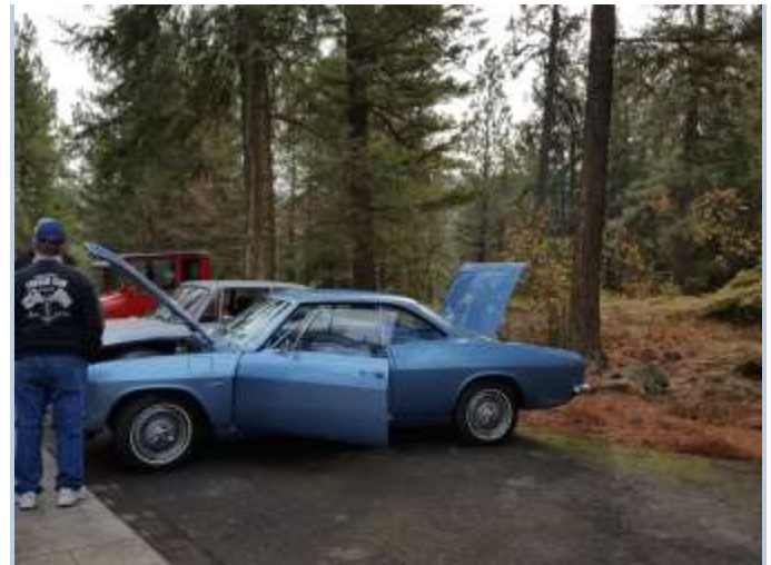
At a recent tech n tune event

If you no longer wish to be a part of the Inland Northwest Corvair Club, please contact a Club Officer and let him/her know. The club's Post Office Box is checked weekly and funds received are deposited during the following week.