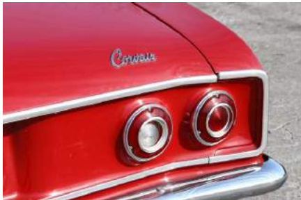
Mecum 1965 Chevrolet Corvair

Claypool believes the 1965-66 Corsa coupe and convertible have the brightest future. They offered 140 hp with four carburetors (tricky to set up), while turbocharging delivered 180 hp, but the engine is happiest over 3000 rpm. Bill Mitchell’s redesign was Corvette-like, and only 27,621 hardtops and 11,495 convertibles were built.