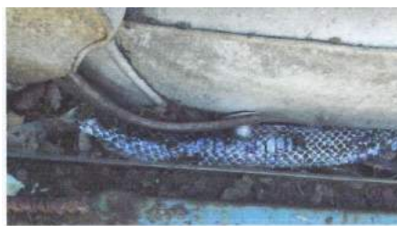
Not much evidence of mouse damage was found while cleaning. Perhaps this shed skin from a rather large snake might provide one explanation.