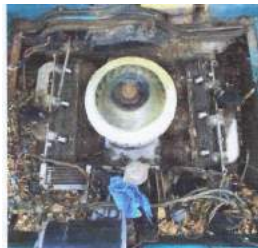
After cleaning decades of leaves and other debris from under the top engine shroud.