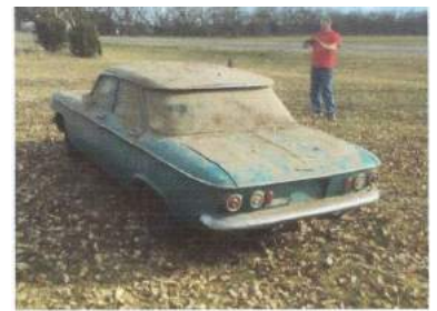
Greg Renfro records the before condition of the barn find sedan that had not seen sunlight this Century.