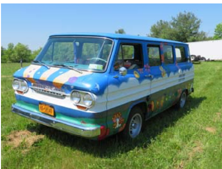
8 DOOR “HIPPIE VAN” Trumansburg area