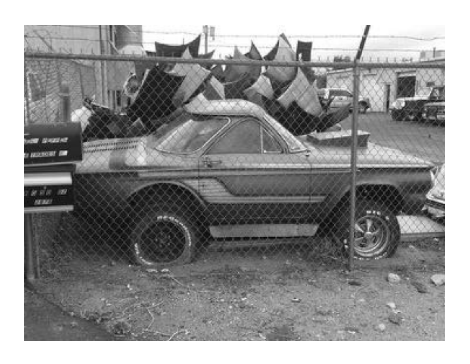
MY SHORT CAR IS SHORTER THAN YOUR SHORT CAR owner unknown