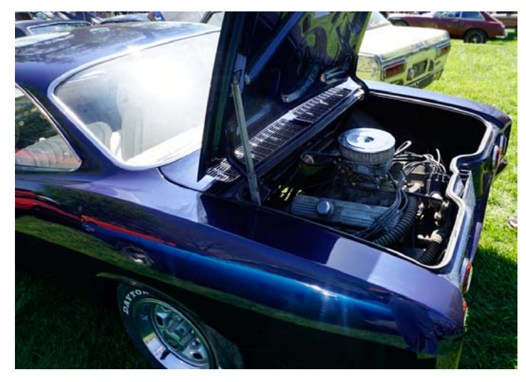
ABOVE: It was great to see several Corvairs in the student section of the show. TOP: A very well preserved '60 Corvair 700 four-door. MIDDLE '63 Monza coupe that has been student owned for years. BOTTOM LEFT: '65 Monza convertible solid body. BOTTOM RIGHT: '65 Monza with aluminum 215 Olds engine in the back.

Lyle and Lonnene had to leave early. The rest of the group headed home after the 3pm Awards Ceremony was concluded.