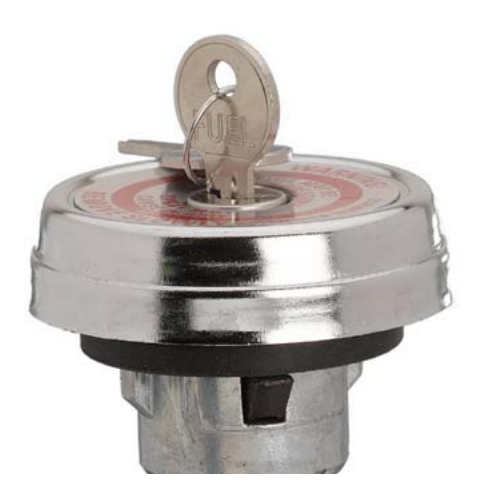
Stant 1042 Locking Gas Cap.

I've been using a Stant 10492 locking gas cap on my '65 Corsa, but it is not truly vented like the original. The locking gas cap has a spring-loaded pressure release valve that releases tank pressure above a certain PSI. I did some research and came to the conclusion that this pressure buildup may have been contributing to an occasional vapor lock issue I had been having. So I decided to modify my locking gas cap to be fully vented in both directions.