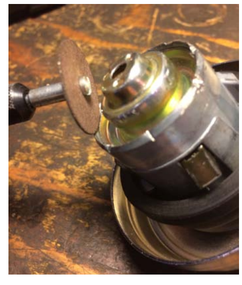
Using a Dremel to smooth the staking inside the casting.

The pressure release valve is a small spring-loaded metal disc located in the steel center section of the locking gas cap, staked inside the alloy outer casting. My idea was to drill a small hole in the metal disc to allow pressure (or vacuum) in the tank to equalize with that outside the tank. I wanted to remove the steel center section of the cap before drilling the vent hole so no metal shavings would end up inside the cap, which could eventually end up in the fuel system.