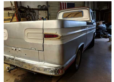
The gray base coat over the faded and prepped original red. Three coats with 24 hours cure between each.