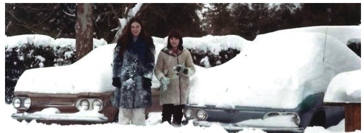
Only pic I have of my first Corvaire (r). Record snow storm, Augusta, Ga Feb, '73