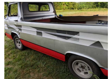
The white 'belly band' and red oxide 'water line' was masked and painted 3 coats. Dazzle camo applied one side at a time.