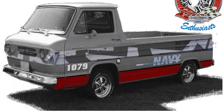
Steve's ideas applied with addition of FF-1079 (USS Bowen) hull number which will actually appear on passenger side.