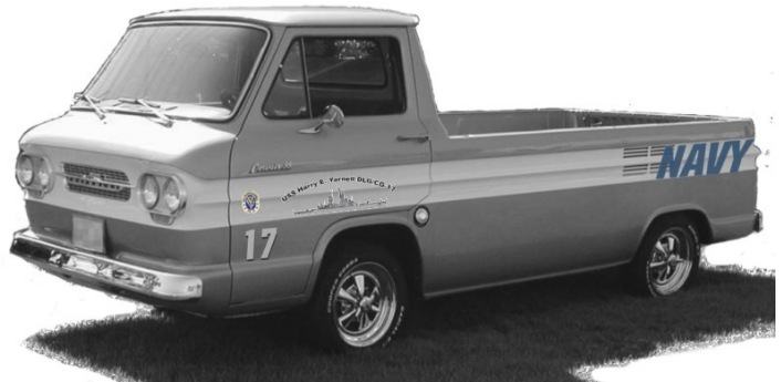
My 'original concept' with CG-17 (USS Harry E. Yarnell) hull number.