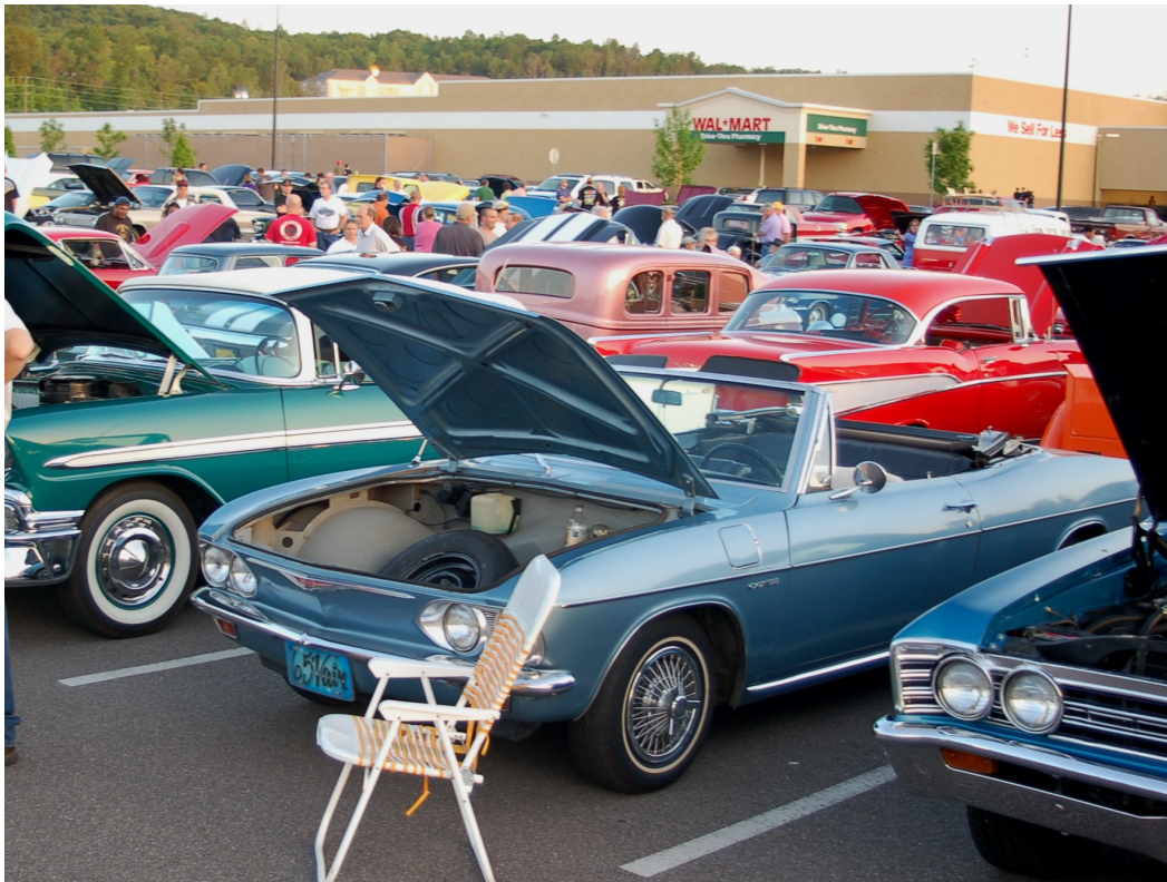
Russell Noble's (Oil Drop Editor July 2008) stately '65 sits proudly among the 'common' cars!. (BONUS Picture from 'Blast From The Past' article)

Contact: STAN (The Glassman) Hudgins 256-487-1282 desotoglass@yahoo.com