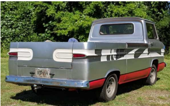
Not yet attached: The OEM tail light reflectors, bumper numbers, and NAVY acronym COMNAVCORVAIRFLT.

My intent all along was to paint the truck just like we did while onboard ship.....with a roller and brush! Therefore 'oil based direct to metal' (DTM) paint is what I am using. Surface prep is important but I am only knocking off the surface rust which is minimal. All the small dents and wrinkles over the years build character so they are still visible. Although easy to apply, the DTM requires masking and is quite time consuming. It also requires a longer cure period before exposing to the elements. THIS is what is killing me right now. I LOVE driving my truck but the only seat time I have until it is finished is moving it in and out of the storage building. Vinyl wrap/decals will be used for the detailed graphics (hull number, NAVY, etc.). The goal is to have it ready for the Perry, Ga. 'Vairs at the Fair' parade October 5-6 th .