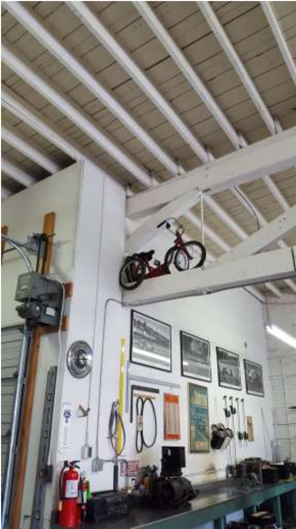
Museum is full of historical automotive and automotive related items, including items for the younger set.