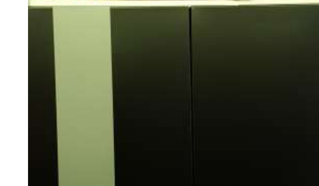
He has another, somewhat smaller Rampside.