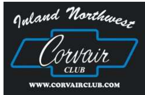
The front of the card looks like this.