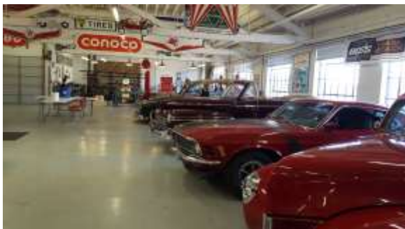
A view along the upper floor of the museum