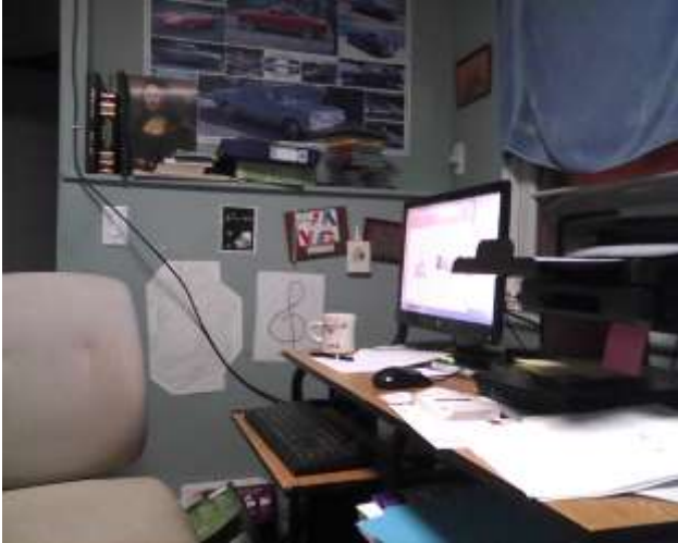
Yes, this is really the editor's desk!

I think we are in the thick of things now. We had two events last month and one coming up later this month. Hope that you all take the opportunity and make the effort to attend at least some of our scheduled activities. As I no longer have Corvairs to show, I will not actively participate in the car show on the 21 st . I will, however try to come by as a spectator for a part of the day.