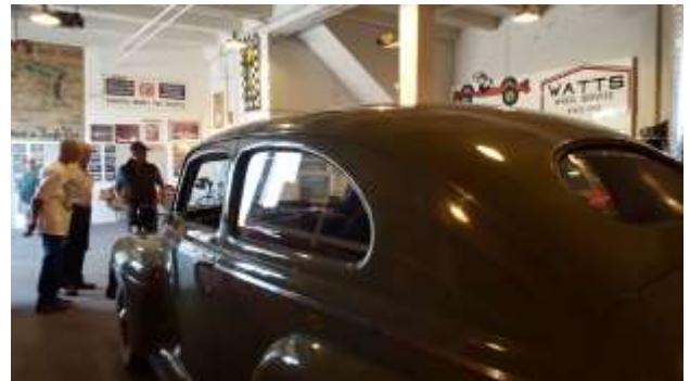
One of the fine classic automobiles in the building.