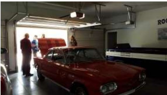
INCC members check out the unique, one of a kind features of Roger's Spyder.