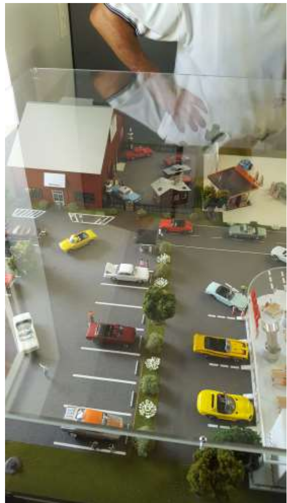
Roger's diorama featuring "matchbox" sized Corvairs.

Consummate hosts, the Beckers provided a lunch of hotdogs or sausages, assorted salads, a variety of beverages, and cake.