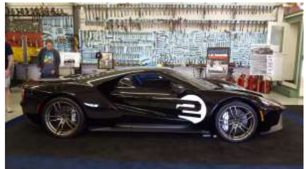
Very rare! Only a few were made and offered to buyers. The Little racing family has this one. Awesome!