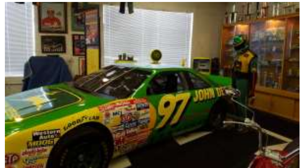
John Deere stock car once driven by Chad Little.