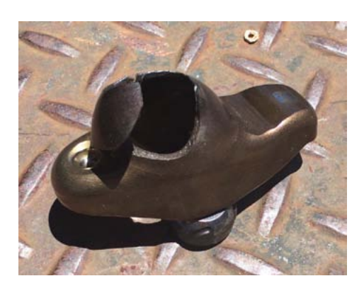
The problem rocker arm.

Once the OKC crew arrives we use a tow strap to move the car up to level ground by the workshop to do some troubleshooting. I pull the left side valve cover and find a broken rocker arm on #6 exhaust. The ball has pulled completely through the rocker arm. Luckily the pushrod is undamaged. Whew! Relief. At least it isn't something major. But of all the spares I brought along on the trip, I didn't bring a spare rocker arm and ball. When I rebuilt the engine I replaced them all with new from Clark's, and the