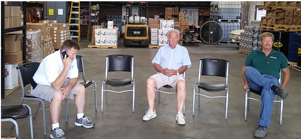
Waiting to get started.