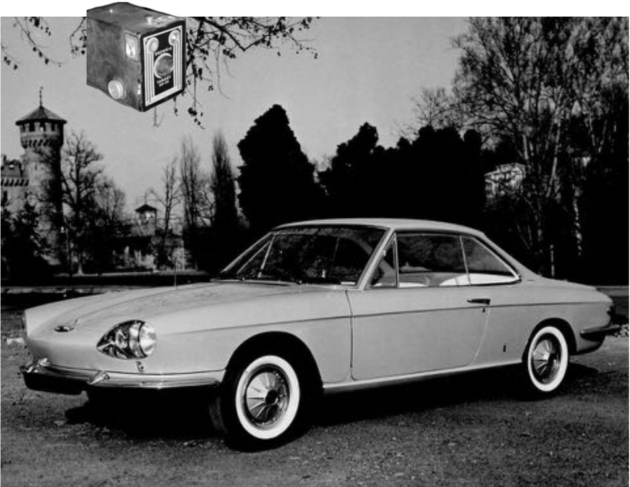
1963. Chevrolet Corvair Coupe 2+2 by Pininfarina.