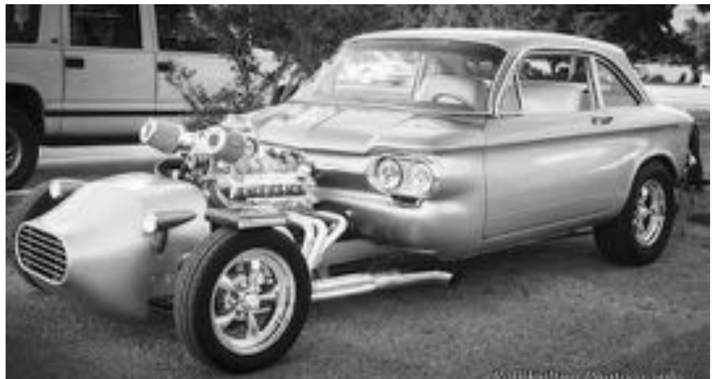
CORVAIR 'SUPER MODIFIED' OWNER . BUILDER / UNKNOWN

The famous Blackhawk Collection and Blackhawk Museum has a car show on the first Sunday of every month called Cars and Coffee . It runs from 8:00 AM till 10:00 AM when everyone either goes home or into the museum. This show is extremely well attended with a lot of family participation. It does enforce a lot of rules, no loud exhaust, squealing tires, noise, etc. What I enjoyed seeing was the participation by the younger generation. Some of it aimed at the traditional classic vehicles, some aimed at the radical and a lot of it aimed at the exotic, import and domestic vehicles. Schools in CA also recognize the need and include classes like Shop, Mechanics and Trades. The "Creative" instinct is very apparent and many of the cars are out of the ordinary but the basic components remain the same. Oh, and don't ask.... the dog wasn't doing too well by the time we left. - John O'Leary