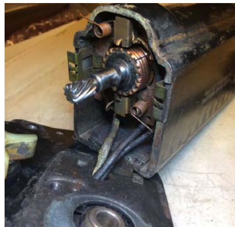
Motor housing and transmission.

Carefully remove the end cover ensuring you capture the small nylon plug (bushing) on the end of the armature shaft. Pull the motor housing away from the transmission a small amount while also pulling the armature out of the transmission bushing (note there are wave washers on the armature shaft). There are wires attached between the transmission and motor housing (field coil), so carefully lay the motor housing over on its