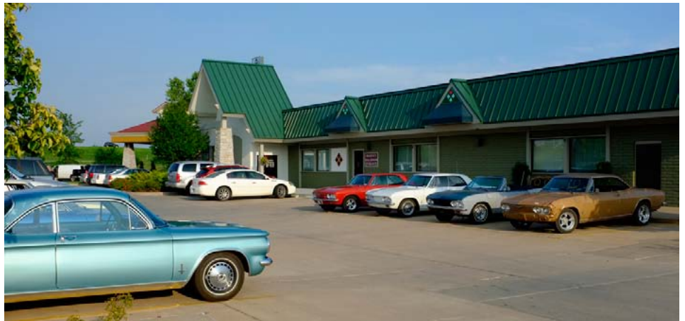
MCCA member's Corvairs parked in front of the Roundup host hotel. The August meeting was held at the Best Western North Wichita.