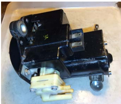
Wiper motor removed from car.

To remove the wiper motor, first disconnect the wiper linkage from the wiper motor crank in the cowl. To gain access, remove the wiper arms and the cowl grill (this is covered in detail in the previous article). On the passenger side remove two Kep nuts (nut with attached toothed washer) to disconnect the wiper linkage from the wiper motor crank. Take care not to drop the nuts or inner & outer copper socket bearings into the cowl cavity.