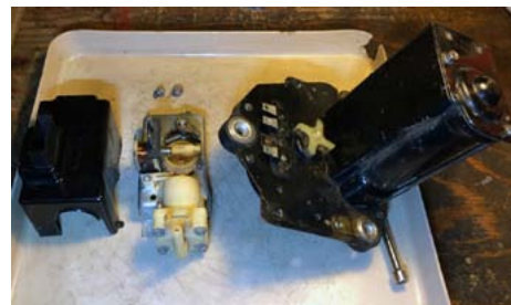
Washer pump removed.

Slide the plastic cover from the washer pump. Remove two machine screws and set aside the washer pump. Remove the two long bolts from the wiper motor.