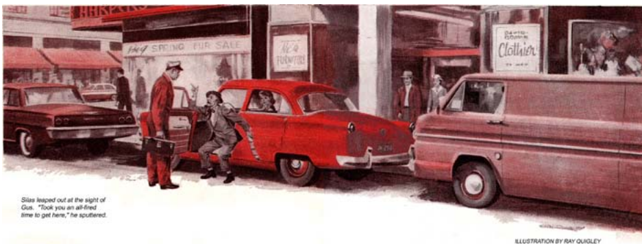
Silas leaped out at the sight of Gus. "Look you an all-fired time to get here," he spluttered.