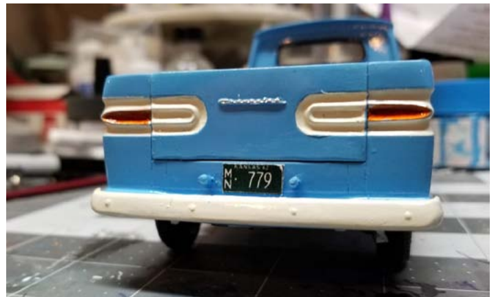
ABOVE: The rear of the scale version. BELOW: The full sized Rampside. Note Greg shrunk the tag.

Greg Renfro found some extra time while he was getting his full sized Rampside road ready and legal to construct a resin bodied version. Instead of building the model like the truck is now, Greg built the model how the Rampside is going to be when finished.