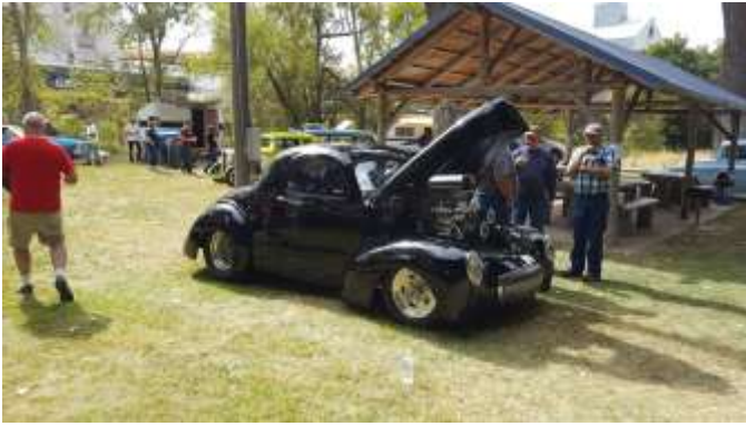
Another Classic Car at the Show-N-Shine!