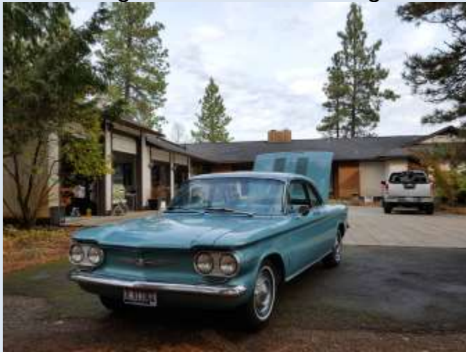
1960 Corvair at the 2016 Fall Tech-n-Tune

Drive, Go 2.5 miles (no turns; road changes name to Highland Dr.) to 5615 and the Lighted Moose on the right side.