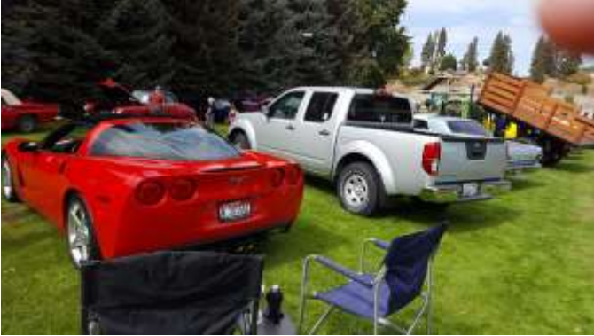
The editor's '14 Nissan Frontier at Palouse Days Show-N-Shine.