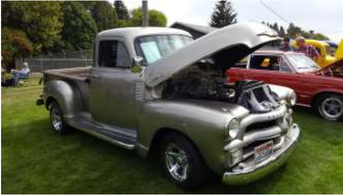
Immaculate 1954 Chevy Pickup!