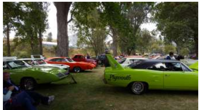
Some of the classic vehicles on display