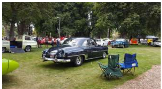
Another view (including Craig's Rampside) of Palouse City Park during the Car Show