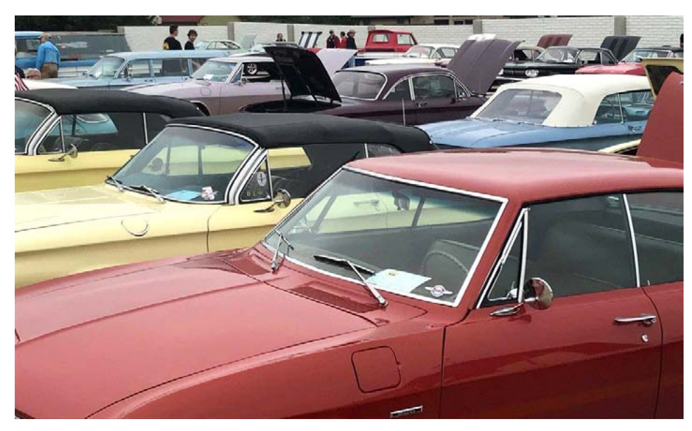
Corvairs clustered in the West Parking Lot at the Best Western North for the 2018 Great Plains Roundup Participant's Choice car show.

fun time to get some miles on your Corvair and provide opportunities to take photos of your Corvair for the 2019 MCCA calendar. (See stories on pgs. 7 & 8 for more details)