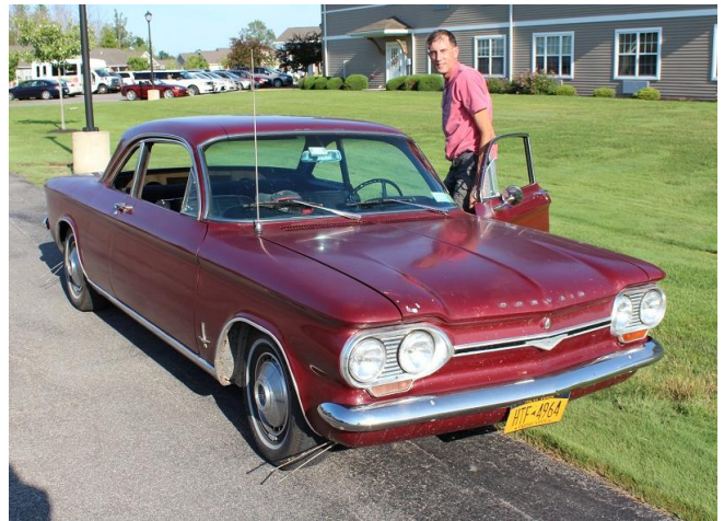
Elderwood Wheatfield cruise