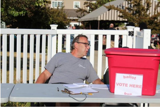
More from Elderwood Wheatfield Cruise

The November meeting will be held on Wednesday November 14 th at the First Trinity Lutheran Church. Normally the meeting would have been the following week, but that was the day before Thanksgiving and I for one am not available that day. Hope to see you then!