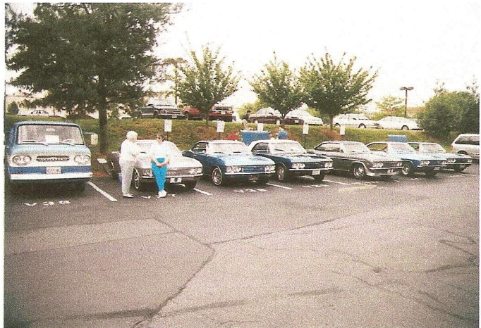
Scenes from our Corvaair Show in 2000