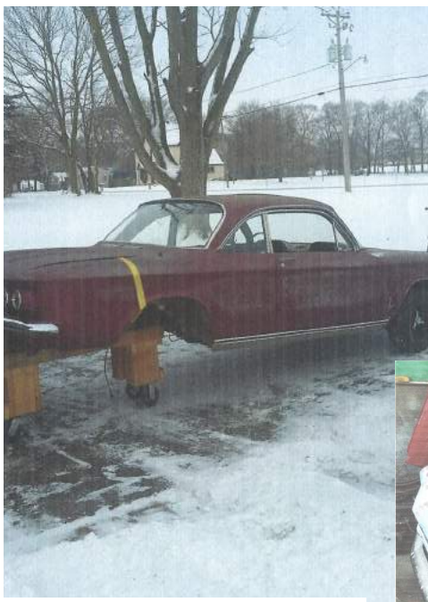
Sort of like inline skates rear wheel drive!