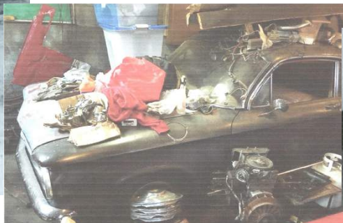
Now where did I lay my wrench?