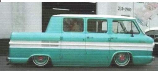
What do you think?