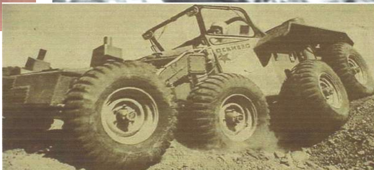
GM Experimental Military Lockheed TWISTER. Powered with two corvair engines.