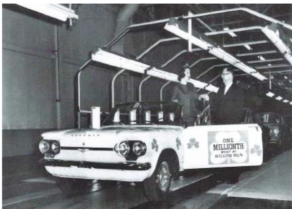
One millionth built at Willow Run