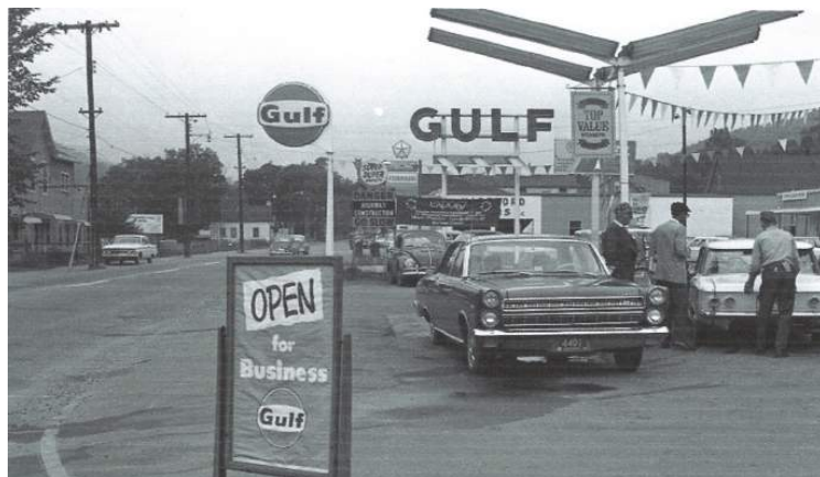
Spot the Corvair? Probably getting gas for .29 - .39 a gallon. Free oil check, windshield washed, tire pressure checked, free coffee mug all for about a $5 fill up. Plus pit stop at bathrooms.