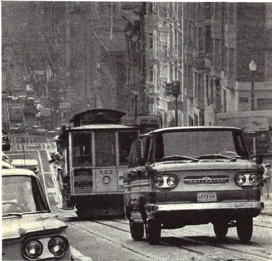
Corvan on Powell St. hill in busy San Francisco.