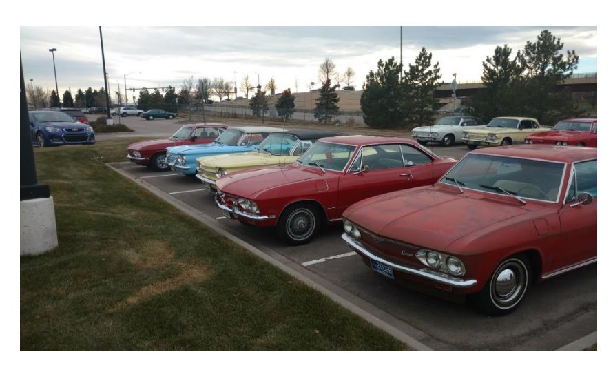
The RMC cars at Mimi's Aurora