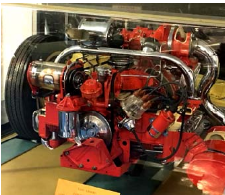
GM cut-away turbo drivetrain.