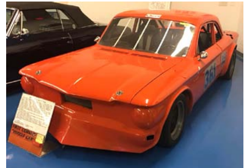
Warren LeVeque's '60 road race Corvair restored to race trim.

The exhibit was filled with all kinds of interesting articles, displays, and engineering prototypes. Included were interior and exterior color chips for every year Corvair made. Clark's had a small display of their own, showcasing the items and services they offer. The exhibit is very educational and a must see for any Corvair enthusiast, especially newbies like myself.