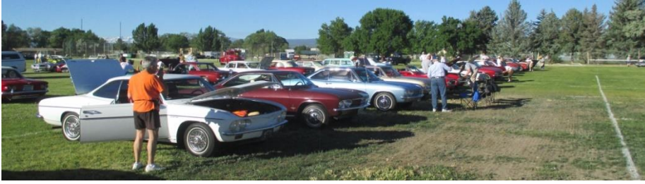
Changes from model year 1965 to 1966. Part 1 of a 5 part series. John Dawson

Items include those first offered in the 1966 model year and items that were put into production during the transition between the 1965 and 1966 model year. This list contains items and changes generally considered to be 1966 in nature but, many were running changes that occurred towards the end of the 1965 model year and therefore can be found on a number of late production 1965 Corvairs. Also a few items were first made available later in the 1966 model year and will not be found on all 1966 models. When possible, dates for running changes are included. Dates on running changes were gathered from the 1965 and 1966 assembly manuals. The dates listed represent the date the changes were incorporated into the assembly manual with a revision. I believe these dates should be viewed as a ballpark figure, give or take a week or two, on when the changes took effect. Although the changes may have actually occurred on the dates listed in the assembly manual, it appears unlikely that GM would be so precise with running changes. Corvairs were also produced in three different plants during the 1965 and 1966 model years, (Willow Run, Van Nuys, Oshawa). You would do well to assume that they did not occur at precisely the same time at all three plants.