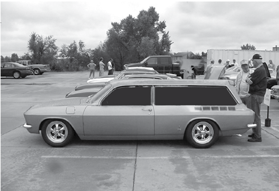
Every once in awhile conversation on one of the Internet's Corvair groups turns to Late Model Corvair station wagons. A recent topic inspired Terry Kalp to use PhotoShop to graft an EM wagon top on a LM.