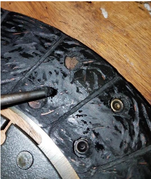
I wonder if there was any noticeable clutch slippage?