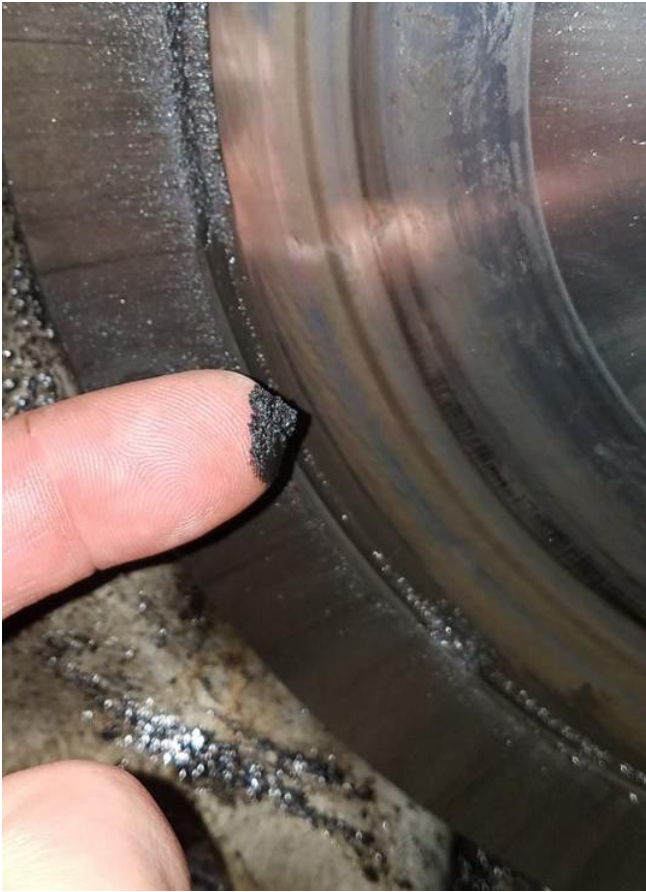
Corvairs were not designed for an oil bath clutch