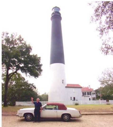
FROM RUTH SWEENEY