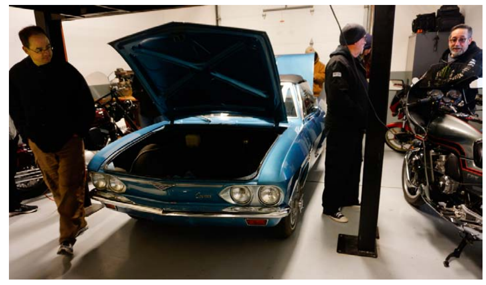
The other Corvair Ross had for sale was this '66 Corsa convertible. It was also Marina Blue, sporting a 110 hp engine and four-speed.

Both Corvairs had Marina Blue repaints. One was a '66 Corsa convertible with a 110 that replaced a broken 140. The other Corvair was a '67 500 coupe that belonged to Reed's father. It was powered by a 110 hp engine and had a PowerGlide transmission. The carbs were off for cleaning.