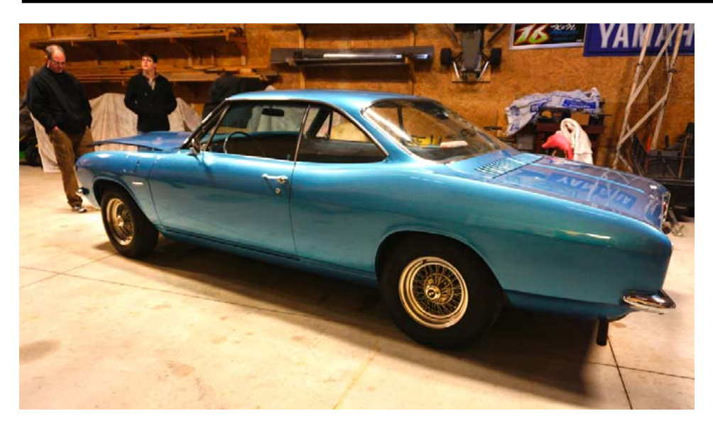
One of the Corvairs Ross Reed had for sale was this Marina Blue '67 500 coupe. It had an updated cloth and vinyl interior, 110 hp and Auto.