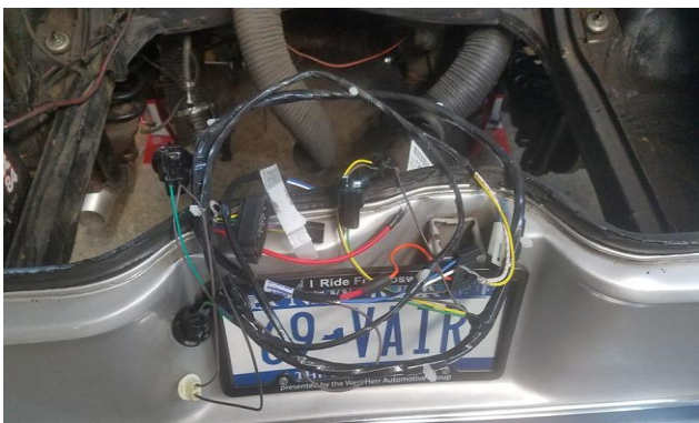
Could be done in time for the cruising season!