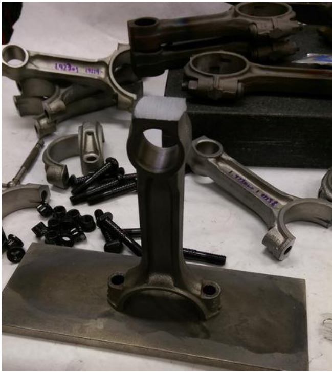
Removed rod bolts and de-burred ends on a diamond stone. Then installed new ARP bolts