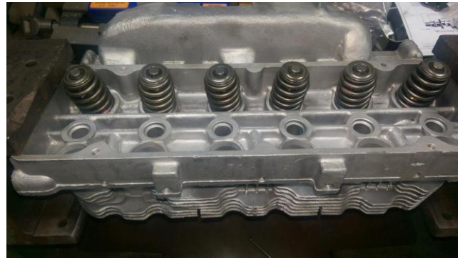
Beehive springs shimmed at 1.800