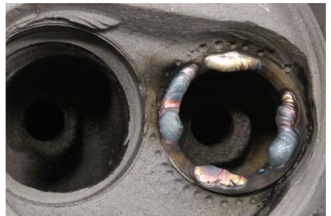
Tom welded around the old valve seat to have them pop out.