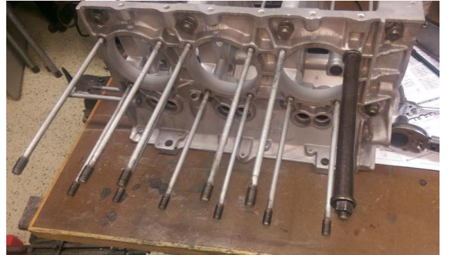
Head bolts pre tested at 40 ft lbs before installing heads.