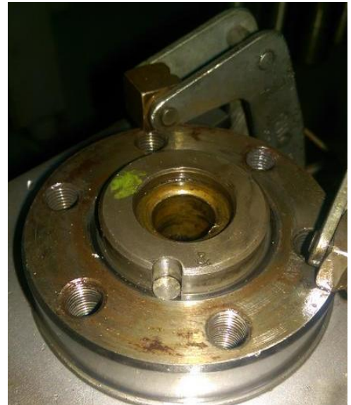
Much prep work on the crankshaft end in the pilot bushing area. Now ready. More updates on this project next month!