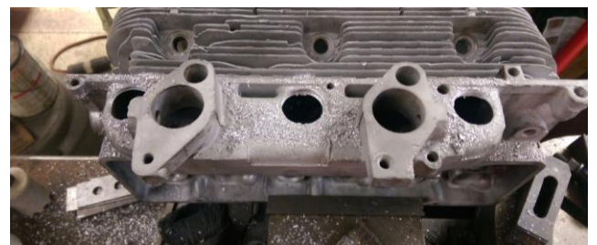
Extra holes drilled in the intake area to hog out extra material for better flow.