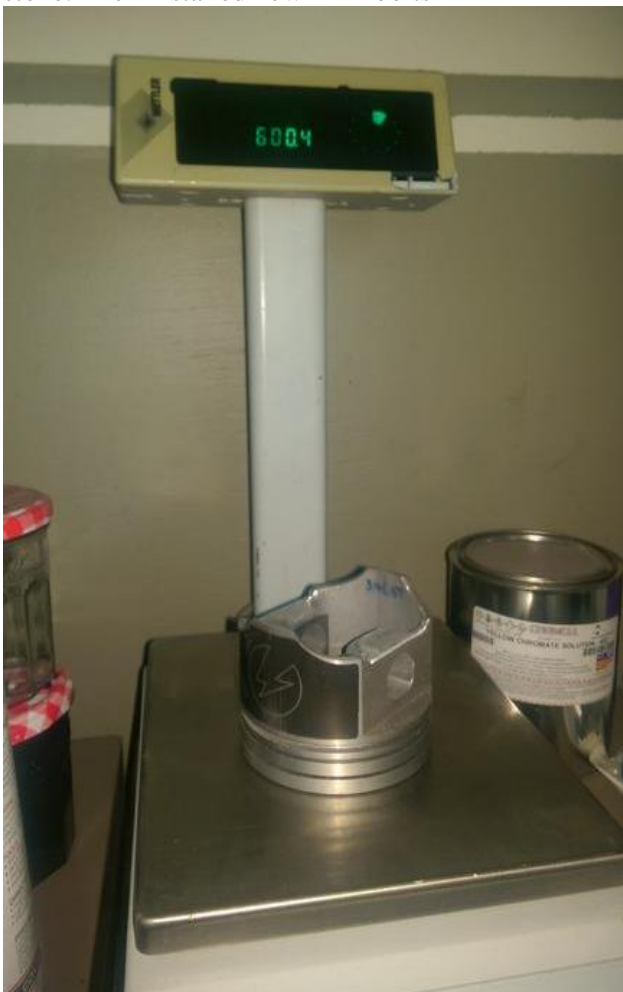
Piston preparation, some weight had to be removed to get them all the same.