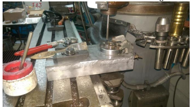
Tom built a fixture to hold the crankshaft vertical for his mill.