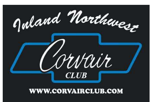
The front of the card looks like this.

business cards with the new club logo on them. They have a place where you can add your contact information. Return address labels might be small enough to fit in the area provided.