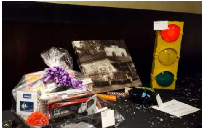
Many door prize packages/baskets were available from clubs, businesses or individuals. Tickets were available at reasonable cost throughout the evening.