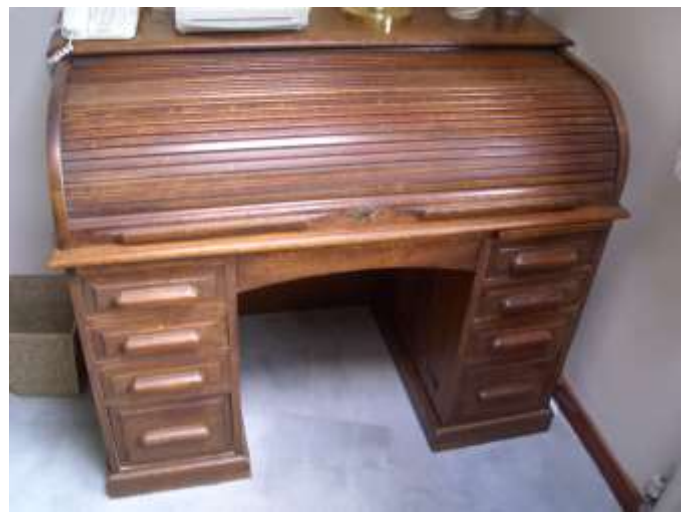
If this was really mine, it would probably have so much junk on it that I would be unable to close it.

I've been waiting on some information concerning the Econo-Run, hence the delay in providing this issue of the Rear Engine Review.