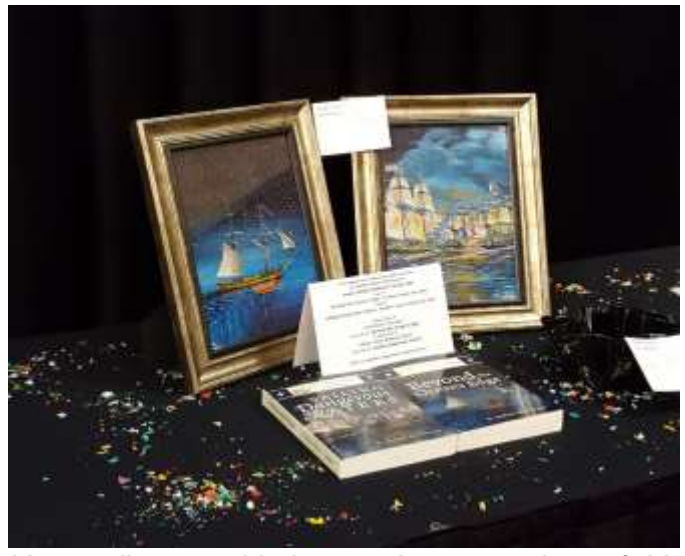
Your editor provided a package consists of his published books and framed prints of the cover art.

The primary reason for these annual events is to acknowledge those people who help make the local car club scene a success. The high point of the evening is the presentation of awards.