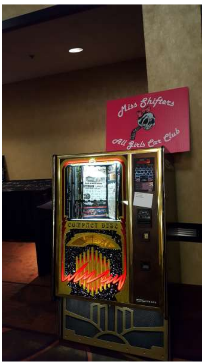
This was no doubt the ultimate door prize at the recent Show-No-Shine event!

After a too long hiatus from the writing mode, work is progressing on the third Stone Island Sea Story. I hope to have the first draft completed by the beginning of spring. It is tentatively titled Darnahsian Pirates .