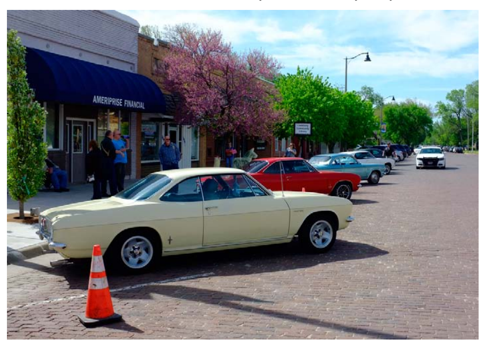
The Lindsborg Police set up a special parking area for Corvairs on Main Street as part of the Lindsborg in Bloom celebration.

A brisk wind combined with a moderate temperature had the MCCA group reaching for their jackets. Once the Corvairs were settled in the group divided up. Lyle and Bill stayed by the Cor-