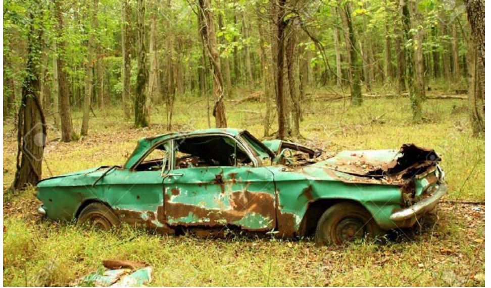
A great "Ran When Parked" photo posted by Geoffery Flynn on the Corvair Owners Facebook page. Send your RWP photos to Terry.