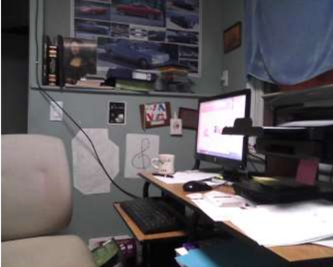
Here's another view of the real thing.

Sorry for the confusion regarding the date of our upcoming Tech-n-Tune. Evidently I was given some erroneous information. I believe what we have now, what is shown in this issue of the REAR ENGINE REVIEW is correct.