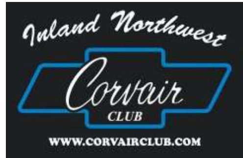
The front of the card looks like this.